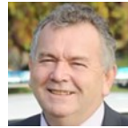
Martyn Underhill, PCC for Dorset

This Guide is the first in a series of guides for frontline professionals. It includes links to more information about the evidence base behind early intervention as well as practical examples of how local police officers are working with partners to spot risk factors and offer help to children, young people and families.